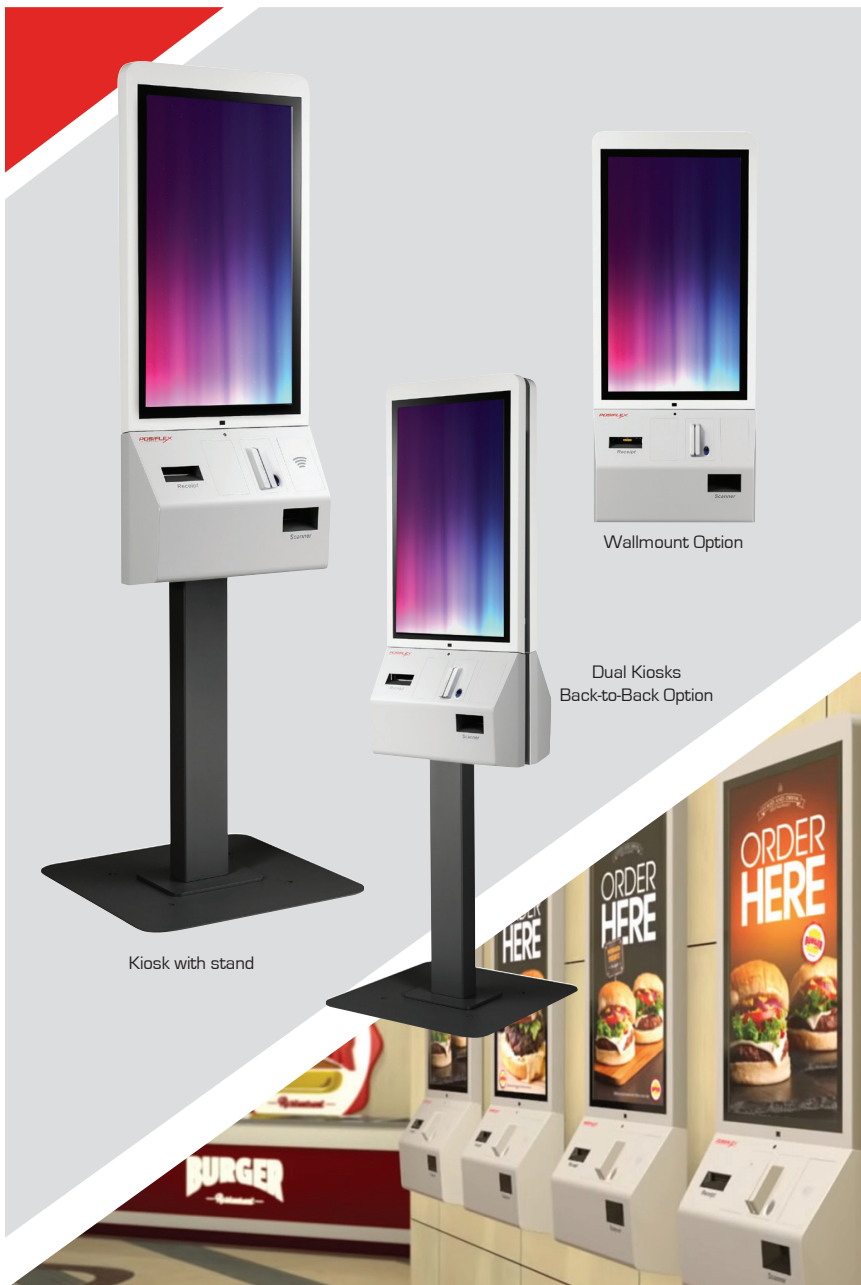
Kiosk with stand