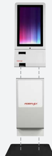
Modular for ease of transporting and significantly lower shipping costs

and modules are efficiently boxed and palletized for more compact and cost-efficient shipping. The Stellar is configured for easy maintenance with hinged doors and simple component access. ADA compliant design ensures self-service access to all your valued customers.